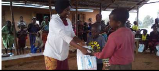
A sponsored child collecting food for his family