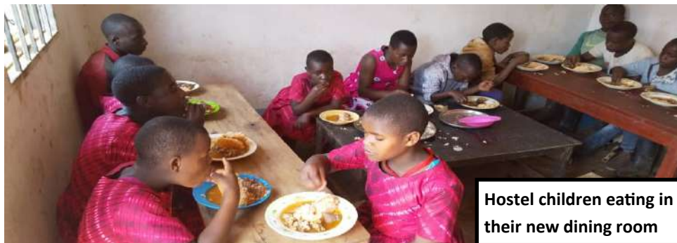
Hostel children eating in their new dining room