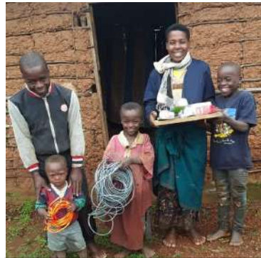
A family with their solar kit

One of our most exciting success stories of the past year has been the installation of solar power to 64 households. Having light can be life changing for the residents of Rwanyana because, being near the equator, it gets dark around 6pm all year round. With light, children are able to study in the evenings, meals can be cooked and crafts can be pursued, many of which are a vital source of income for people in the community.